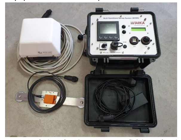
MOSS unit (right-top) with motion sensor (left-bottom) and IRIDIUM unit (left-top)

The MOSS is a practical, robust and portable measurement solution with many options to log and monitor different kind of inputs. The system can be applied in harsh environments without any special installation requirements.