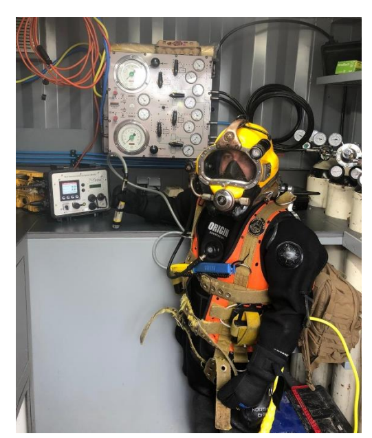
MOSS unit in use in diving-container

The depth sensor can be applied with a separate cable on a reel or direct to a free cable on the umbilical of the diver.